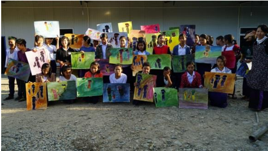
The Awaiting Home