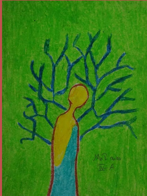
The Tree of Life

I think the idea and vision of the painting class is meaningful. Firstly, children have the opportunity to learn painting. Secondly, through seeing our paintings, people in the world will know what we have been going through, have empathy and understanding for our feelings and support us.