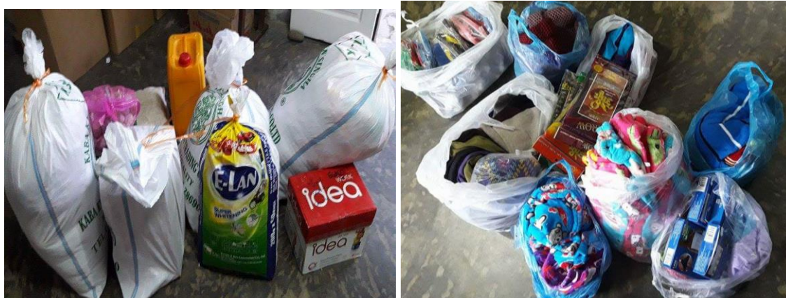
Nutritious and hygiene materials donated by Daw Nang Baw (Australia)

Beside this, additional nutritious and hygiene materials support to the affected family is also a crucial at the movement. In every year, rice farm was destroyed by rats, pests, diseases and local communities always faced with shortage of food. They have to survive through eating non-timber forest products (NTFP) which were low nutritious values. So, it's important to support nutritious supplements and hygiene materials to the leprosy infected patients as well as the family members.