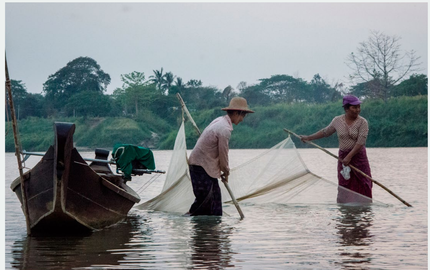
Communities rely on the Ayerwaddy River for food

Community Resilience Component —has supported four ongoing largely locally funded ECCD schools in Tanghphe, Mazup, Lahpe and Dawng Pan benefiting 374 children (191M/182F). There are now vibrant Micro Credit Union in target villages in Myitsone area supporting livelihood activities. Inspiring riverside stories have been collected in the Airavati headwaters in Kachin State illustrating cultural, tradition and heritage and practices of village communities who are living and relying on natural resources.