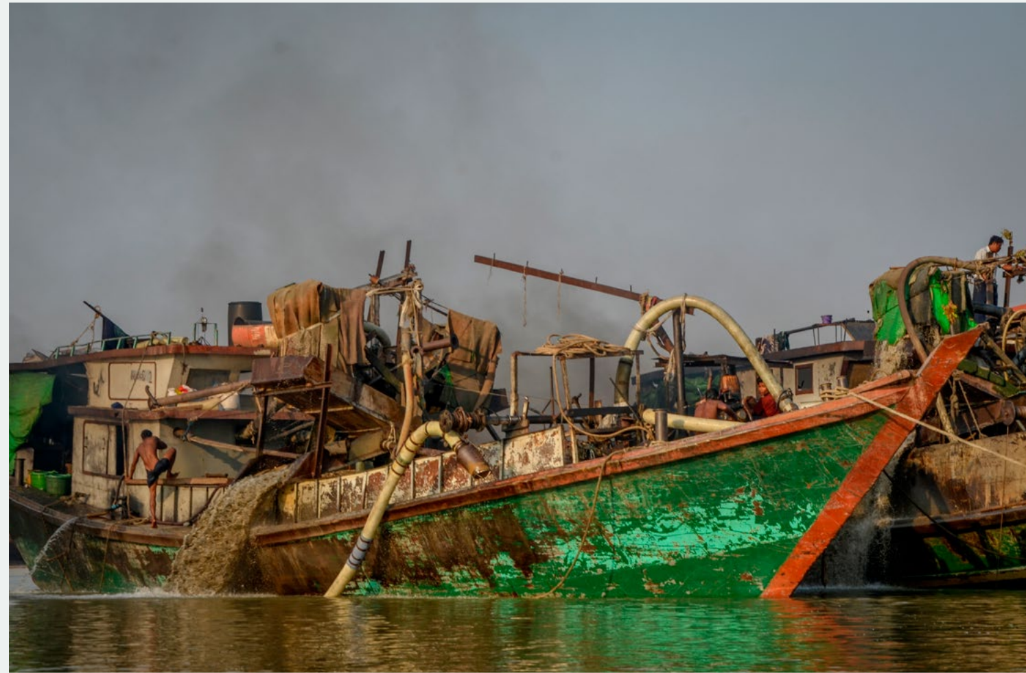
Sand-mining is damaging the Ayerwaddy watershed