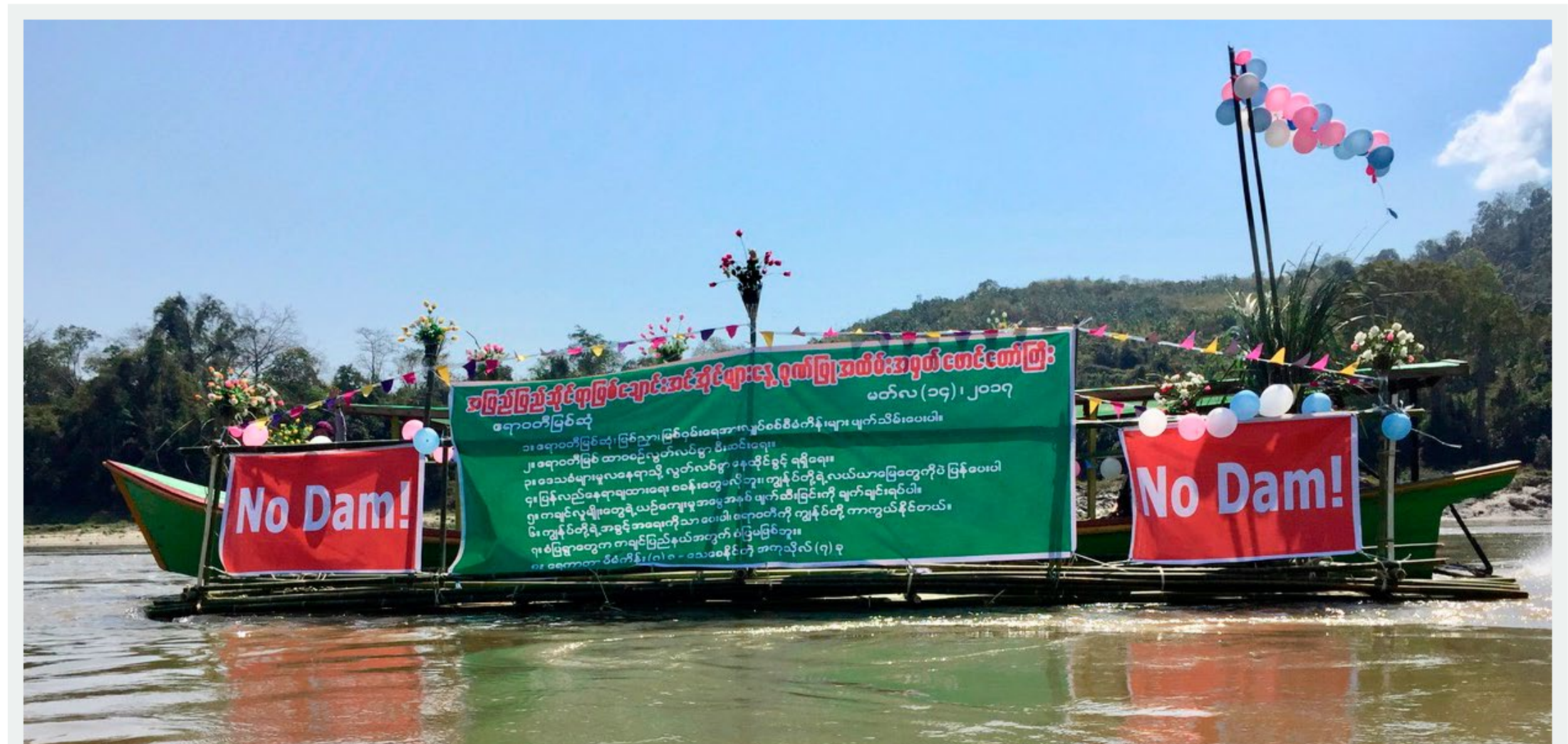
Top: Proposed Chinese Infrastructure Project Myitsone Dam, Kachin State Bottom: Relocated villagers protest against the Myitsone Dam