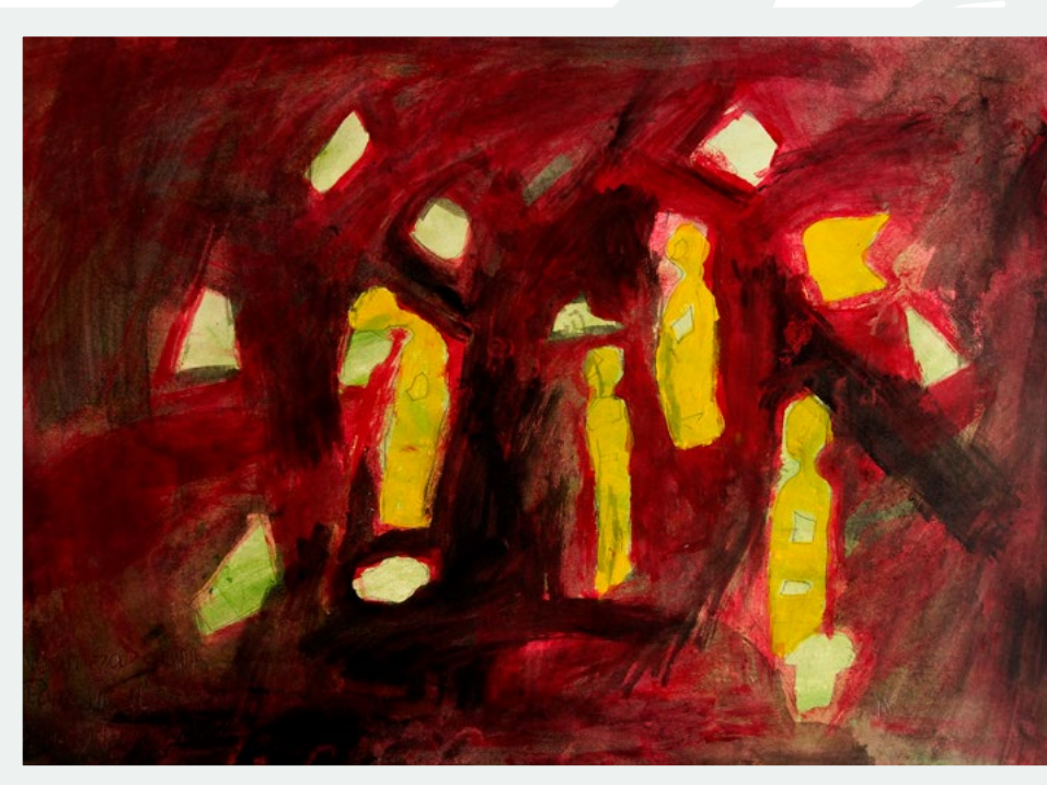
Photos from the Children's Art Project "Finding Light from the Broken Part"